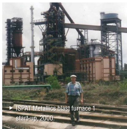
► ISPAT Metallics blast furnace 1 start-up, 2000.