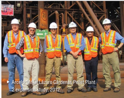
► ArcelorMittal Lázaro Cárdenas Pellet Plant 2 expansion study, 2012.