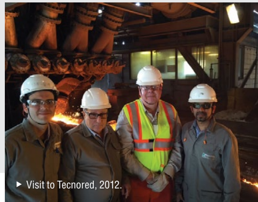
► Visit to Tecored, 2012.