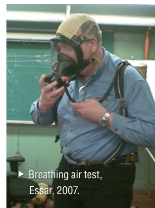
► Breathing air test, Essar, 2007.

gives back positive energy to the reward recipients and their supporters and peers.