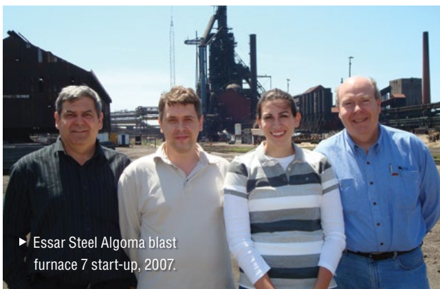
► Essar Steel Algoma blast furnace 7 start-up, 2007.