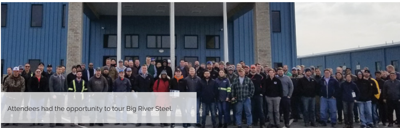
Attendees had the opportunity to tour Big River Steel.

look for ways to better control and refine the melting and chemistry.