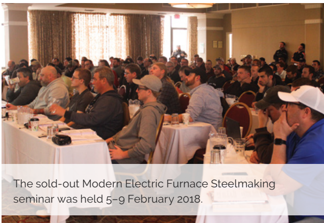
The sold-out Modern Electric Furnace Steelmaking seminar was held 5–9 February 2018.