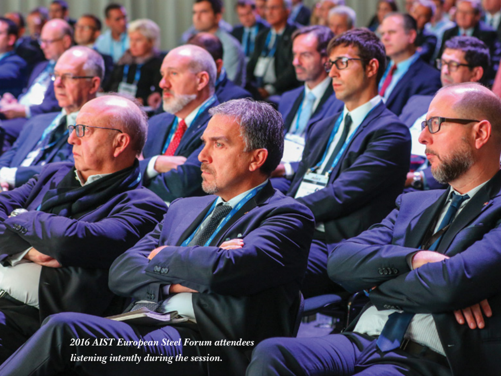
2016 AIST European Steel Forum attendees listening intently during the session.

As a whole, the EU accounts for nearly 17% of the world's crude steel production, ranking behind only China. Individually, six EU countries — Germany, Italy, Spain, France, Poland and Austria — rank among the world's top 20 producers. Additionally, the EU's steel production is spread across 500 sites that together employ around 319,000 people. For comparison, the U.S. steel industry has 95 production sites and directly employs 142,000.