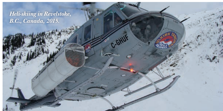
Heli-skiing in Revelstoke, B.C., Canada, 2015.