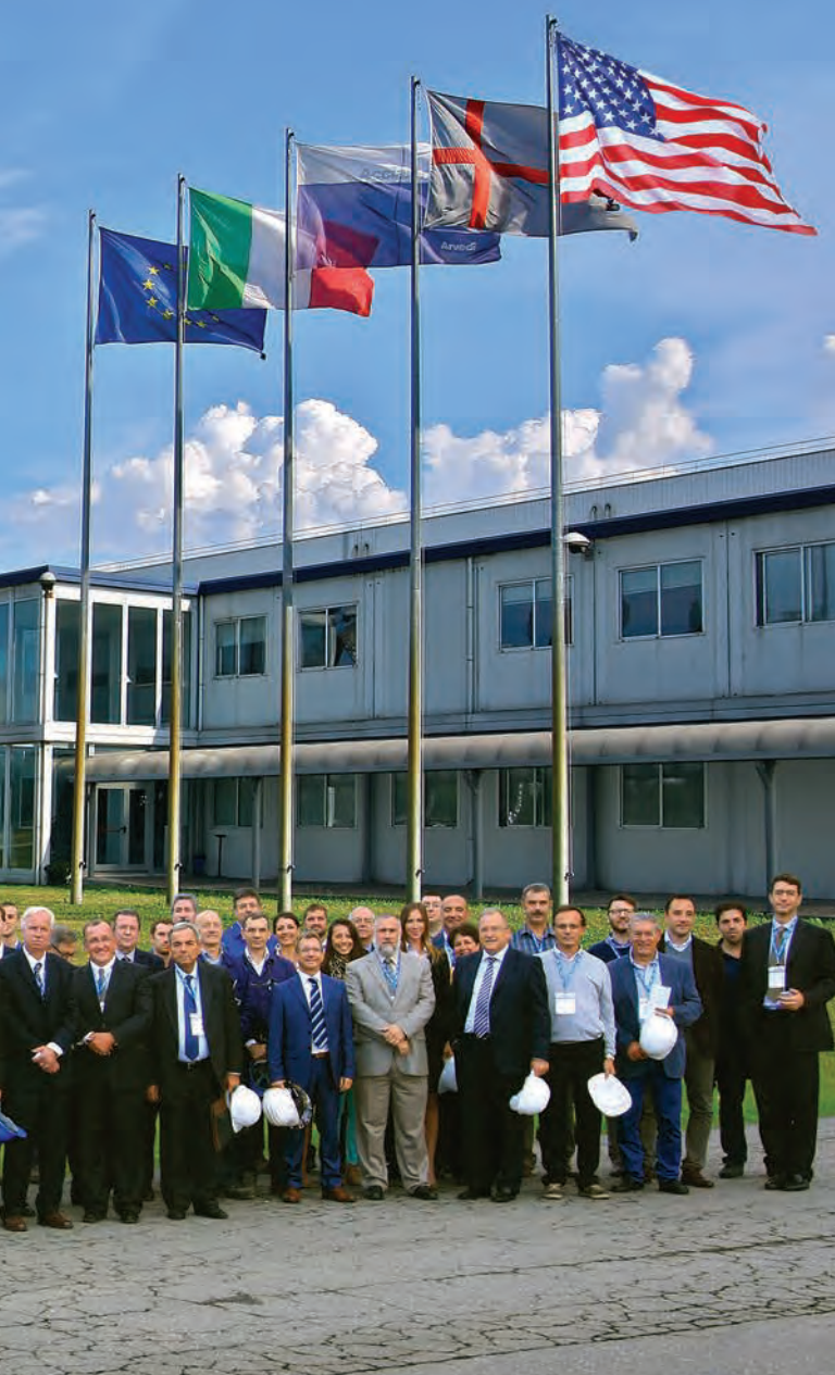
AIST Italy Steel Forum attendees visited Acciaieria Arvedi S.p.A. in Cremona, Italy.