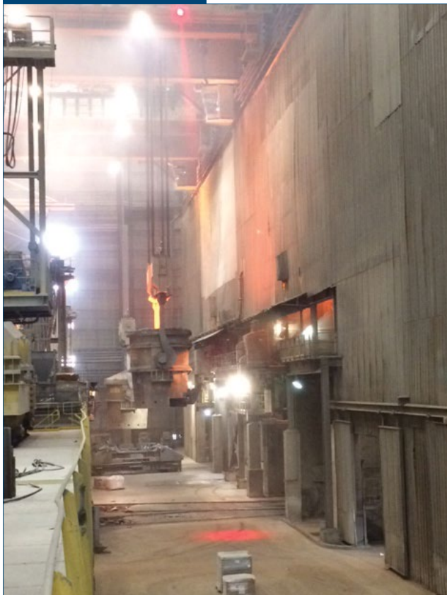
A red 24 LED light at 100 feet received positive comments from employees on the visibility of the light.