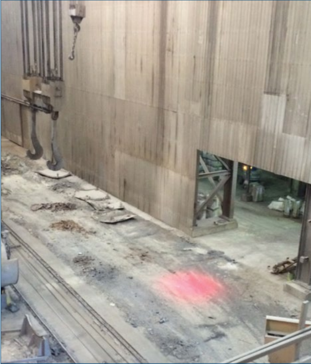
The warning light can be angled out from the overhead crane to forewarn pedestrians of crane movements.

meet the needs of our facility. We encourage each facility interested in this technology to experiment with different types of colored lights in their facility to determine which light best meets their needs.