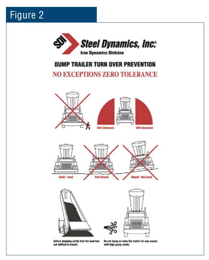
Warning sign about dumping risks present in some Steel Dynamics Inc. facilities.

Unevenly distributed material can cause a dump trailer to be unstable. Trailers that are loaded with a loader can be loaded heavy to one side and material can shift in transit, causing uneven distribution.