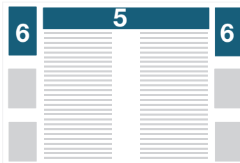
(5) 600 x 75 px (6 & 7) 130 x 200 px