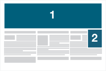
(1) 970 x 250 px (2) 170 x 200 px

AIST offers multiple opportunities to build your brand, promote your services and sell your products through our digital advertising opportunities. Reach new customers and grow your audience through banner ads on AIST.org or by advertising in our weekly, monthly and event-specific emails.