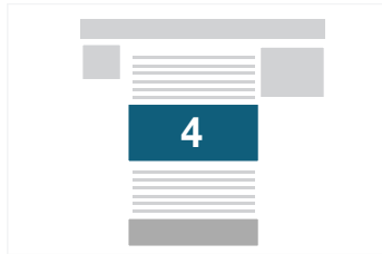
(4) 1200 x 628 px 280 characters