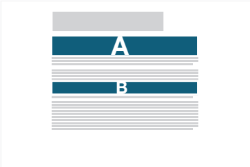
(A) 650 x 50 px