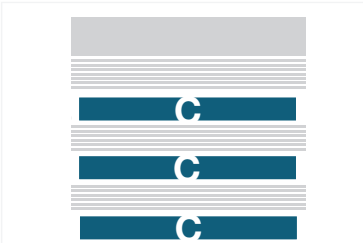
(C) Banners: 650 x 50 px; Advertorial: graphic - 160 x 60 px, headline - 66 characters, text - 66 characters