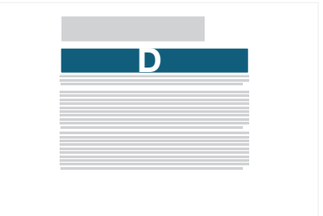
(D) 650 x 50 px