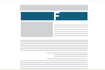
(F) 650 x 75 px