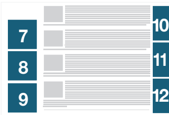
(8-10) 220 x 200 px (11-13) 100 x 200 px