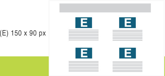
(E) 150 x 90 px