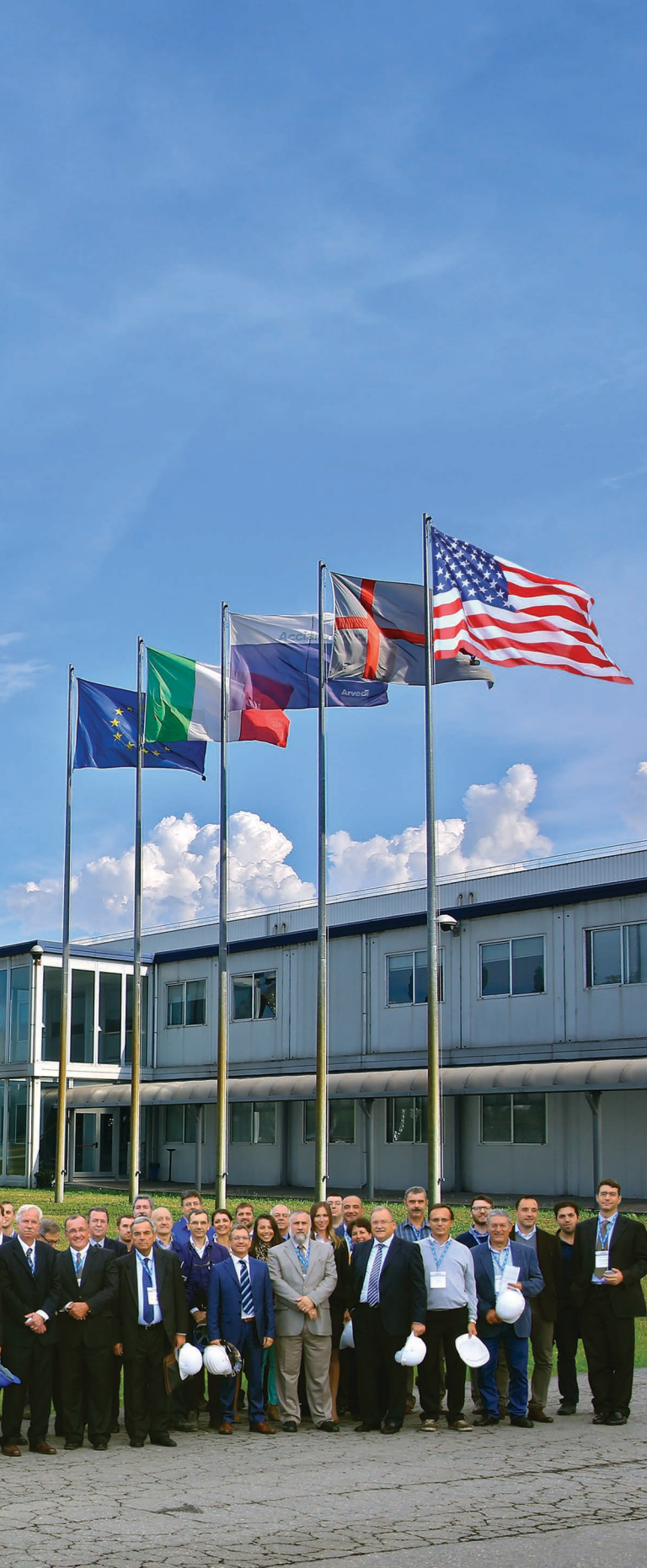
AIST Italy Steel Forum attendees visited Acciaieria Arvedi S.p.A. in Cremona, Italy.