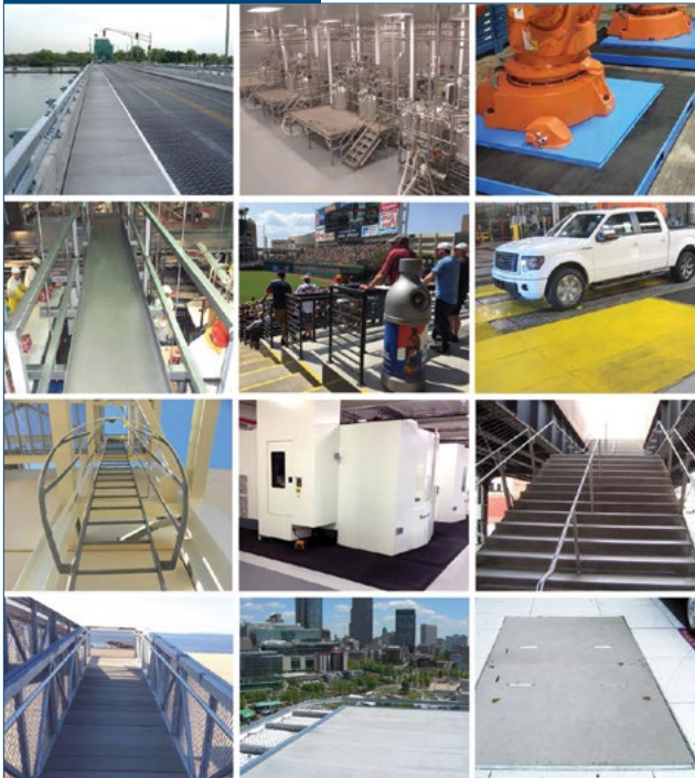
Locations that may benefit from slip-resistant flooring options.