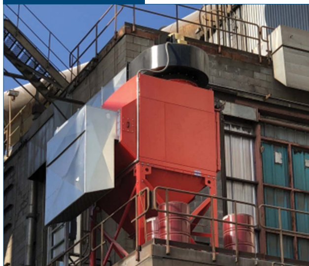
Self-maintaining air cleaner installed on exterior of steel mill.

collector, taking dirty air from inside the facility and filtering it before venting or returning it. To maintain positive pressure with this type of use, ambient air will have to be added back into the building along with the filtered air in order to maintain positive pressure.