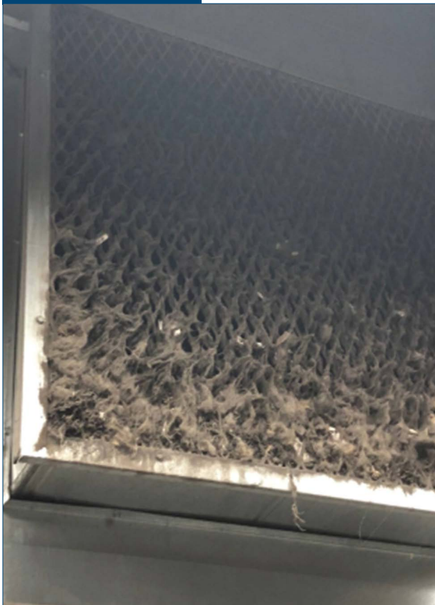
Standard HVAC filtering motor control center.

This concept can be applied to steel mills and the critical spaces that need to be kept as free of dust as possible. Rooms in a steel mill don't need to be as clean as a hospital room, but a hospital atmosphere will not put nearly as much strain on the filtration system as the air in a steel mill. Keeping a room under positive pressure keeps dust from entering. Whenever a door is opened, air will try to flow outward, pushing back against dirty air that might flow in.