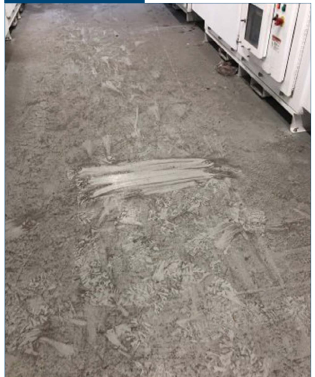
Dust accumulation in a motor control center.