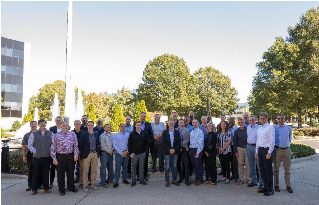
Nucor Corporation and SMS group teams worked together to specify the highest quality, most reliable caster for Nucor's special needs.