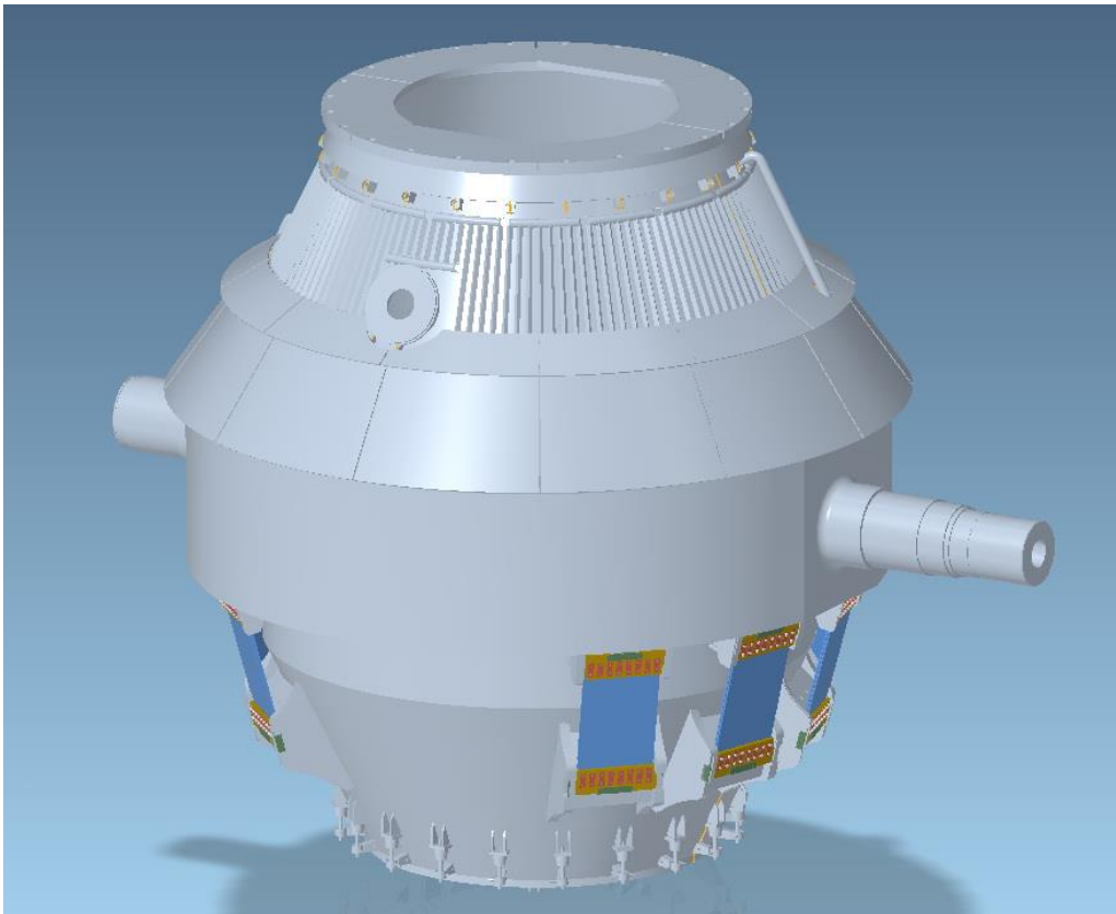
Converter with SMS group lamella suspension system.